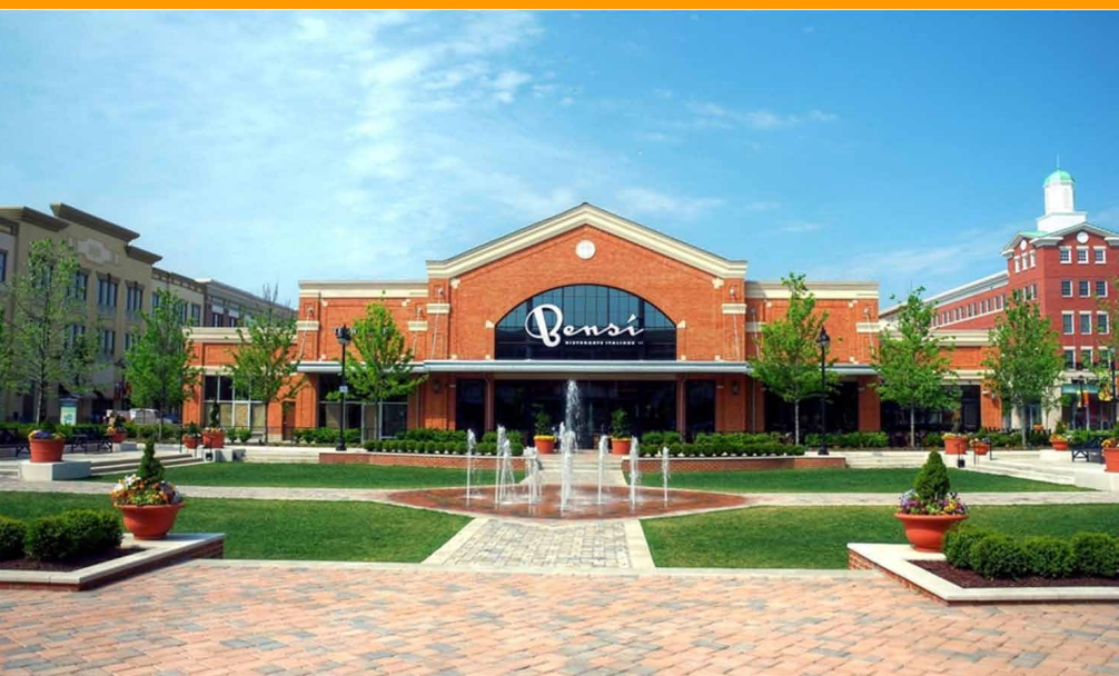
The Bensi restaurant was one of many architectural plans evaluated by ICC Plan Review Services to ensure compliance with Virginia code specifications.

2010, incorporates four blocks of modern urban food, fun, office and living space.