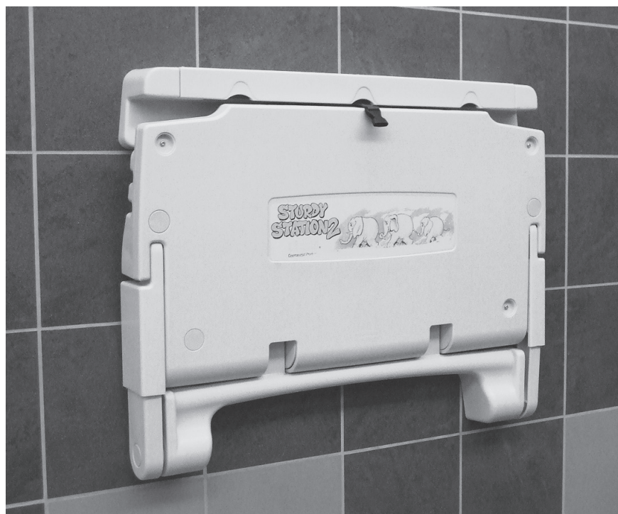
Figure 1 – Diaper changing table—folded.

Should the diaper changing station be located in the family-assisted use bathroom? While not required in a family assisted-use bathroom, the intent of this type of facility is to offer everyone who needs assistance to