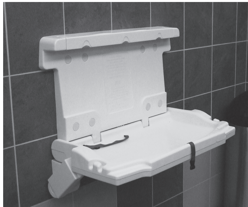
Figure 2 – Diaper changing table—unfolded.