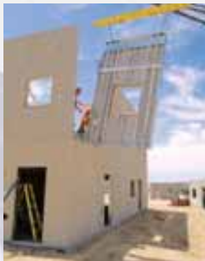
One of several facilities constructed at the U.S. Army's National Training Center in Fort Irwin, CA that will incorporate new environmentally-friendly Ecolite wall panels.

The new Ecolite wall panels are prefabricated, noncombustible solid wall panels made from 50 percent recycled materials that emit no volatile organic compounds, and the small volume of concrete used reduces carbon dioxide emissions. Better yet, the new wall panels qualify for four different LEED categories. The wall system weighs approximately 400 percent less than conventional precast concrete wall systems.