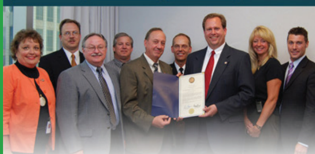
Lobby Day at the Ohio Statehouse recognizing Building Safety Week 2009

After three decades of success, the Code Council and ICCF expand Building Safety Week into a month-long celebration.