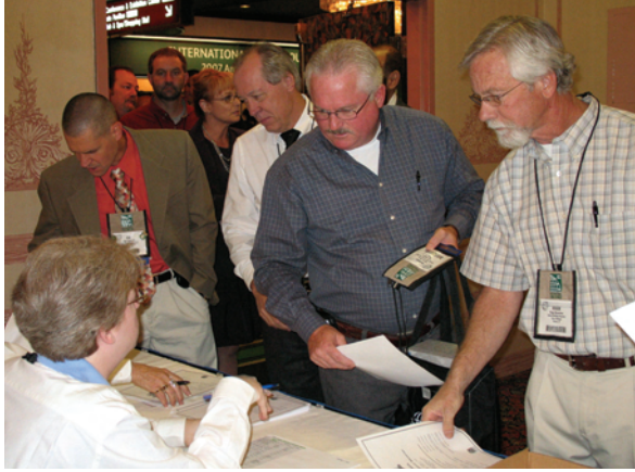
More than 250 Chapter presidents and officers attended the Chapter President's Breakfast—a record for the event.