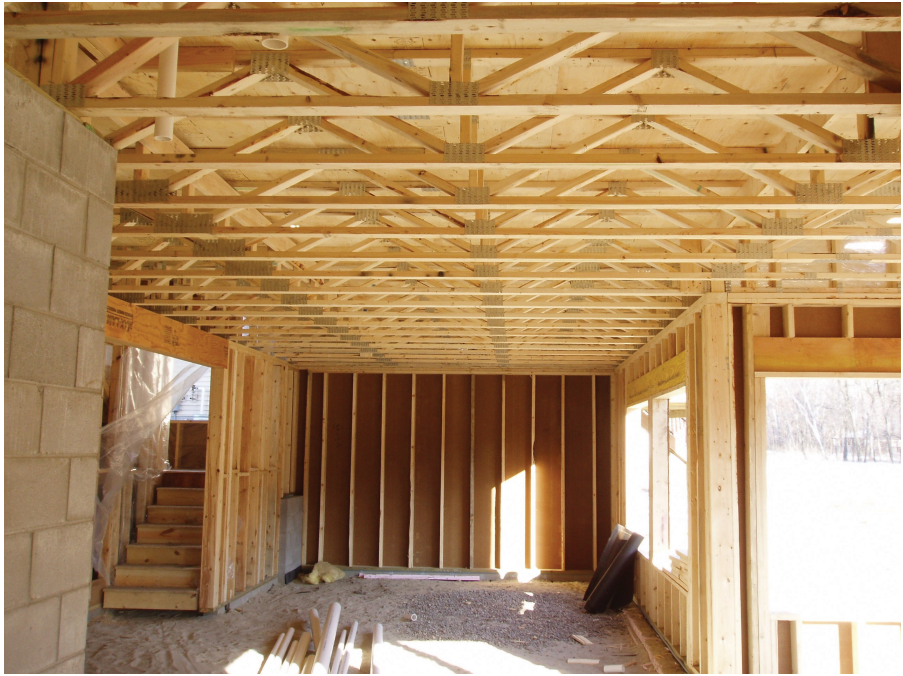
Open web floor trusses requiring membrane protection on the underside

nominal 2 \times 10 s or larger of these materials are exempt from these fire protection requirements. Fire protection also is not required if sprinklers are installed to protect the space below the floor assembly.