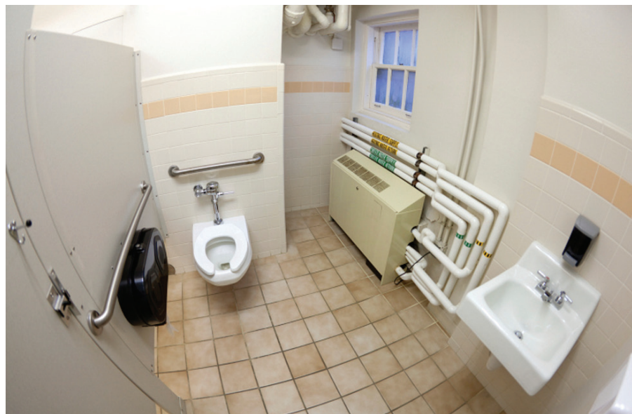
An accessible lavatory must be available to all users