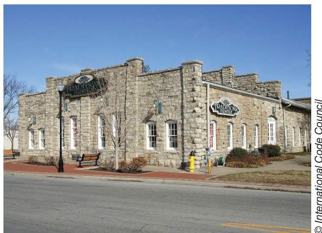
Existing buildings are regulated by the IEBC