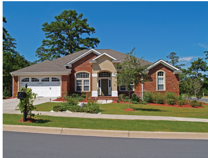
Dwelling with front-yard access to a public way