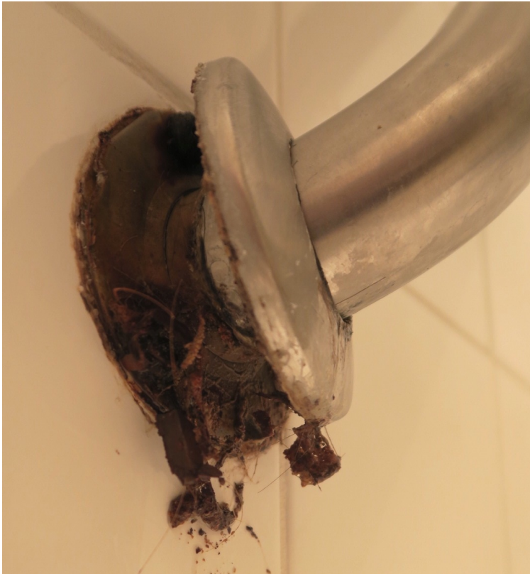
Figure 3. Corrosion behind grab bar cover plate

Clearly such examples need to be addressed in several ways including stronger inspection by authorities and improved management of facilities. Improved design and manufacture of conventional grab bars would help too but, until that occurs, this proposal offers the stanchion options as well as mounting locations that keep the important “points of control” in relatively dry locations, for example at the exterior of a shower enclosure, but still near enough to the entrance to be usable from both outside and inside the enclosure. Proposed Section 2726.2.3 contains the provision, for the grab bar or stanchion to be located either interior to or outside of the shower compartment. . . .