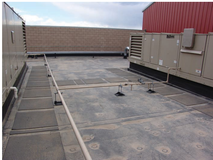
FIGURE 13-11 Thermoset single-ply adhered roof

Roofs with a greater than 3:12 slope or pitch are considered to be steep roofs. Common materials used in steep roofing include asphalt shingles, wood shakes or shingles, and clay or concrete tiles. The IBC provides prescriptive installation requirements for these three systems as well as metal roof panels and shingles. In all of these roof systems, there are five important components: decking/sheathing, underlayment, membrane, fastening, and flashing. Underlayment is one or more layers of asphalt-impregnated felt, sheathing paper, or nonbituminous saturated felt. It is applied over the decking material prior to the installation of a roof membrane. The code outlines the installation requirements for each of these components depending on the type of system being installed.