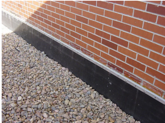
FIGURE 13-9 Low-slope roof flashing

Low-slope roofs traditionally have been constructed with an asphalt built-up roof covering. This system is a series of multiple layers of asphalt-impregnated sheets of felt paper and hot asphalt. Most built-up roof systems are comprised of three layers of felt and asphalt. The top of the roof system is then covered with a gravel surface to protect the asphalt from ultraviolet (UV) rays of the sun. The UV rays degrade the oils in the asphalt and reduce the effectiveness of the roof system. Built-up roofs are required to be a minimum of one-fourth-inch-per-twelve-inch slope. When coal tar pitch is used in a built-up roof, the roof slope is permitted to be reduced to one-eighth inch per foot. The materials in these systems must comply with several ASTM standards.