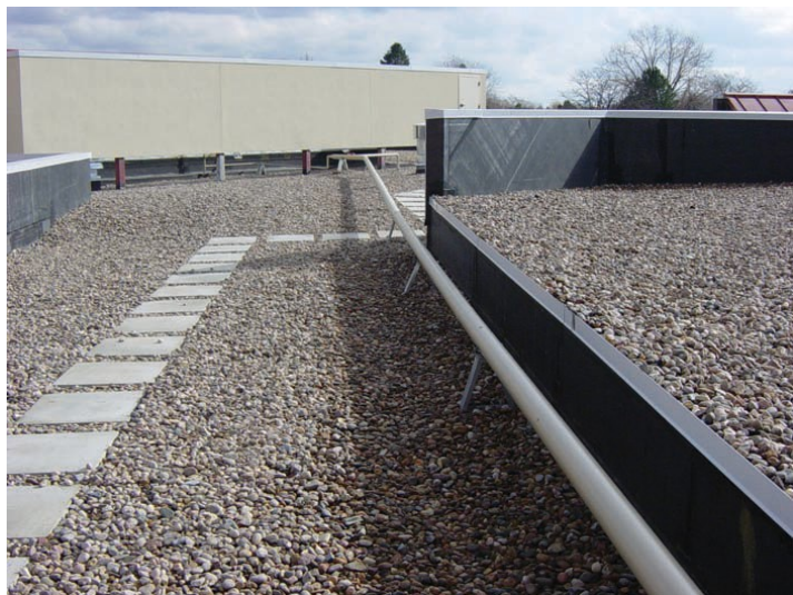
FIGURE 13-10 Ballasted single-ply roof system

Different materials have been introduced into the market for low-slope roofing. All of these systems must be installed in accordance with the manufacturer's installation instructions. Most of these materials are single-ply systems, which means that there is only one layer of membrane material applied as opposed to a built-up roof or multiple-ply system. Modified Bitumen roof coverings are one or more layers of polymer-modified asphalt sheets. These systems can be either fully adhered to the roof sheathing or mechanically fastened. In some cases, these systems are held in place by a ballast of large stones or paver systems. The ballast resists uplift of the membrane from wind passing over the top of the roof and creating a negative pressure on the system (Figure 13-10).