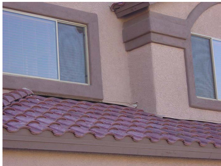
FIGURE 13-13 Clay tile roof system

The tile must comply with two ASTM standards. Clay tile must comply with ASTM Standard C1167, and concrete tile must comply with ASTM Standard C1492. Both must be fastened to the roof decking in accordance with IBC Table 1507.3.7, which outlines the fasteners required for each type of roofing tile based on the wind speed, height of the roof, and slope of the roof.